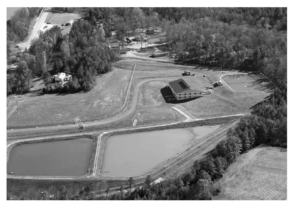
By October 2002, customers from the towns of South Hill, La Crosse, Brodnax, Boydton and the community of Bracey were receiving water from the authority.

Five other towns in Mecklenburg County were then invited to join the regional water system. On behalf of South Hill, B&B prepared a report detailing a new water system to serve the six towns and the Bracey community. The plan included a raw water intake on the Roanoke River/Lake Gaston, a water treatment plant near the intake, water storage tanks, booster stations and water mains to serve the towns and communities